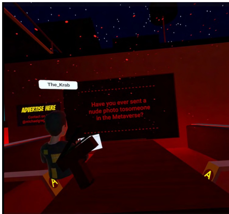
The Adult Club, Horizon Worlds