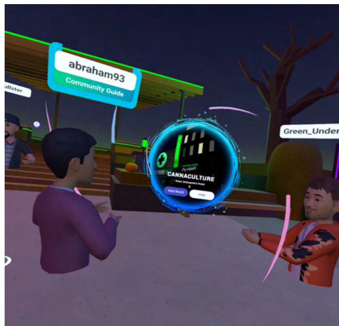
Venues, Horizon Worlds