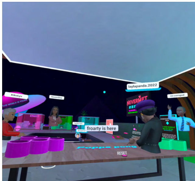
Party House, Horizon Worlds