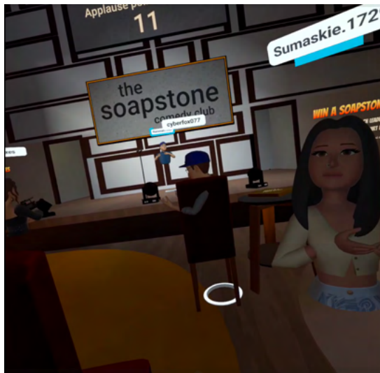
The Soapstone Comedy Club, Horizon Worlds