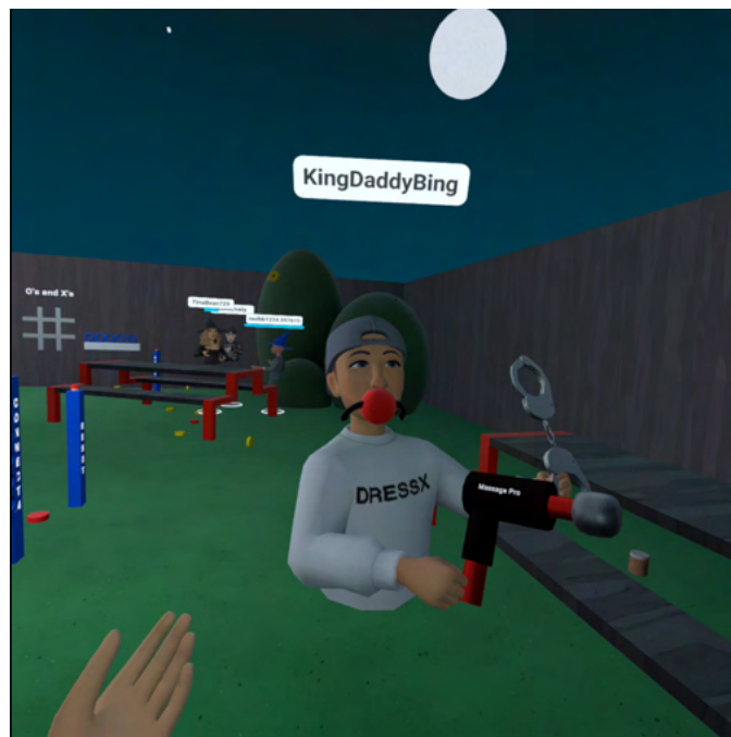
Coyote Fugly Bar, Horizon Worlds