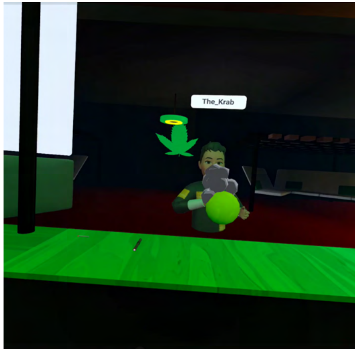
Jamaica Paradise Club, Horizon Worlds