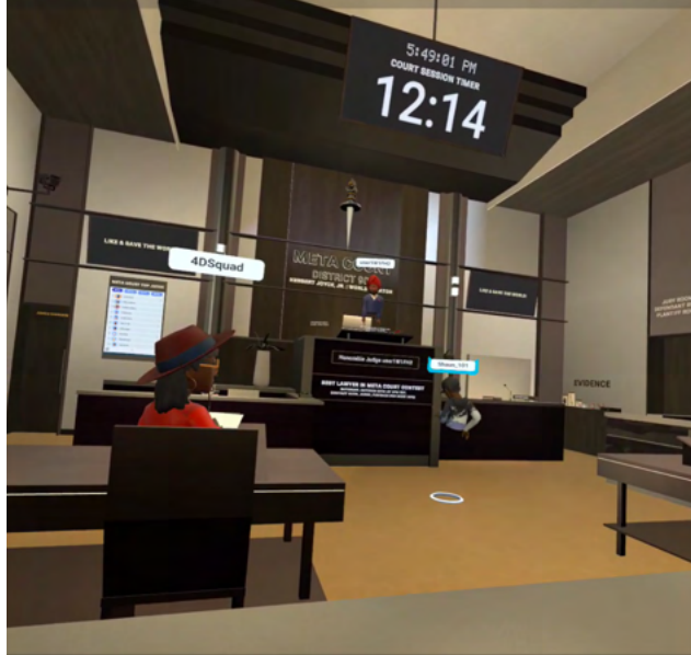
META COURT 2.0, Horizon Worlds