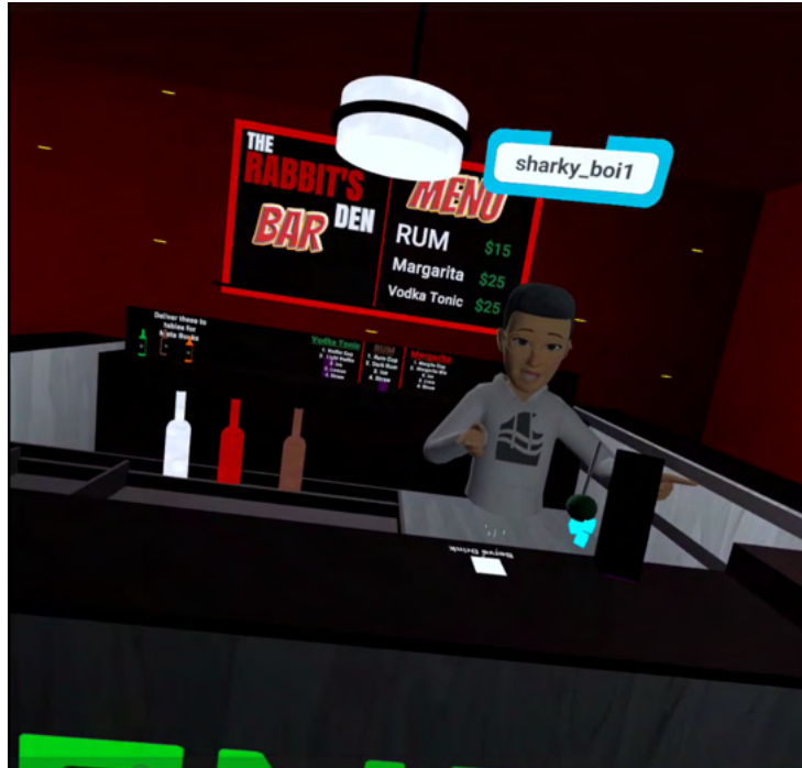
The Rabbits Den, Horizon Worlds