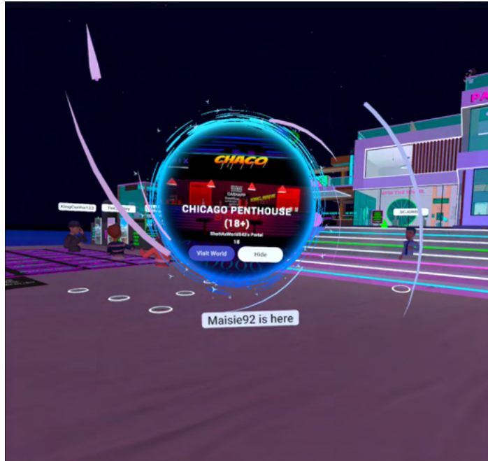
Party House, Horizon Worlds