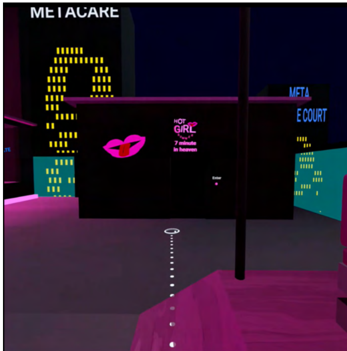
Hot Girl Summer, Horizon Worlds