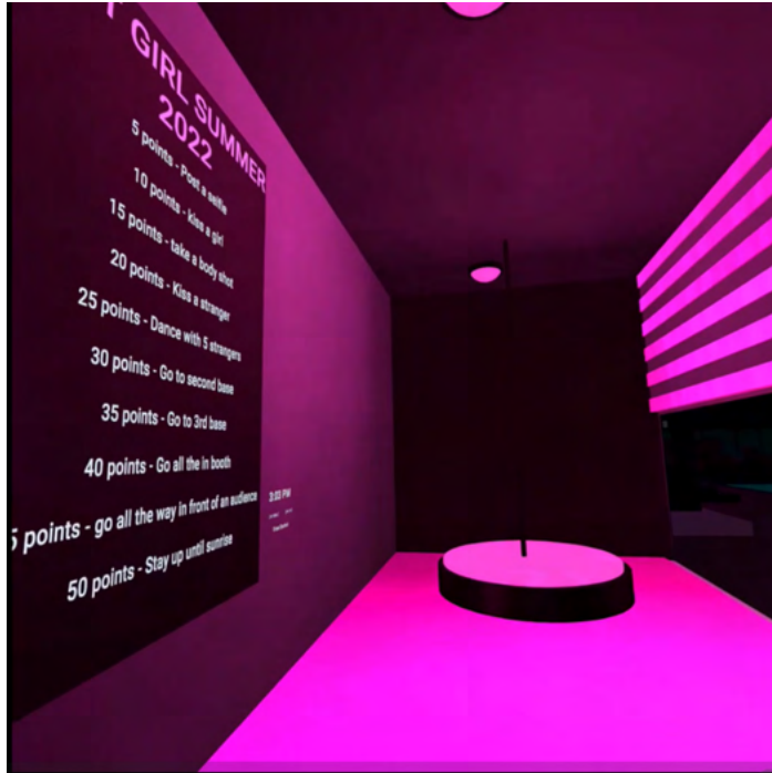
Hot Girl Summer, Horizon Worlds