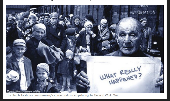
Headline and image from a Press TV article about the Holocaust published in 2014